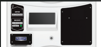
MLE22PRAYW MLE22PRAZW MLG22PRAWW